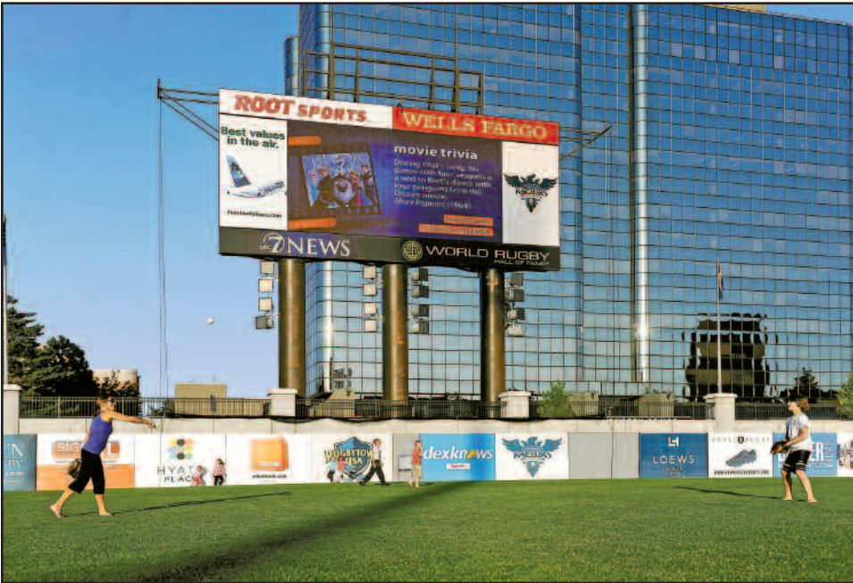
Everyone, regardless of age, is free to be youthful, to smile and laugh at a scene as if they're seeing it for the first time at Monday Movie Madness.

as the stadium lights go down. Everyone, regardless of age, is free to be youthful, to smile and laugh at a scene as if they're seeing it for the first time, despite the fact they know every word. The event could very well have been named Monday Movie Magic.