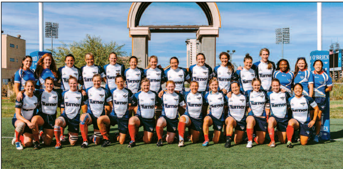
The Glendale Raptors Women team for the 2016 Women's Premier League rugby campaign.

The growth of the team's overall depth including the expansion of the Raptors' Division I team was also a highlight for