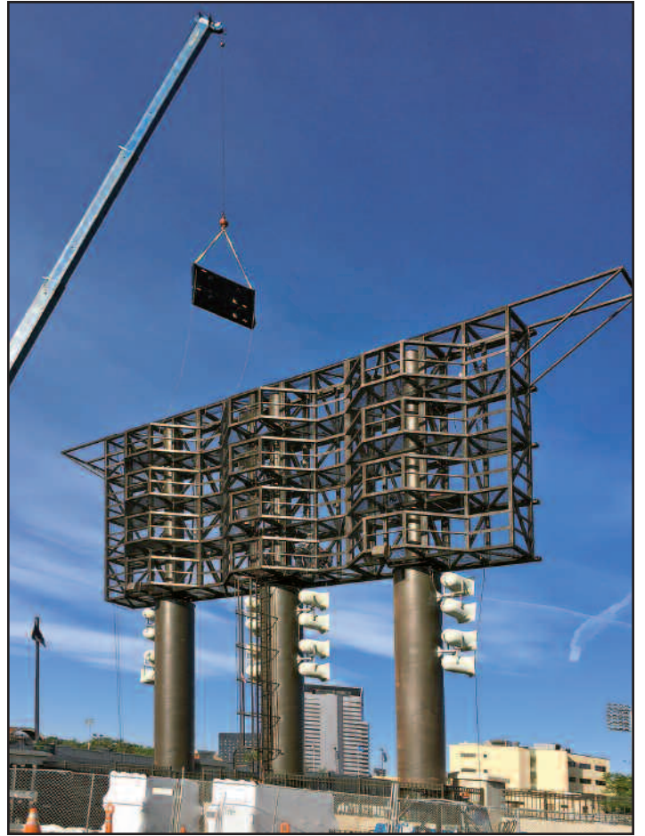
A crane lifted jumbo screen components onto the larger frame as part of the installation process.

All that new space will enhance the in-game experience for fans and will give advertisers more value for their sponsorship dollars. Instead of a static sign with a company logo printed on it, like the ones that surrounded the old video screen, the new video screen will be able to have moving logos, will be able to incorporate sponsors